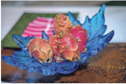
Above, Champion Platt Interiors' tabletop design for the inaugural Tabletop Design event at The Colony.

At the Holiday House Tablescape Event at The Colony, sky blues, celery greens and hand-blocked dinner napkins were chosen for the design of Casa Branca Palm Beach's table, at right.